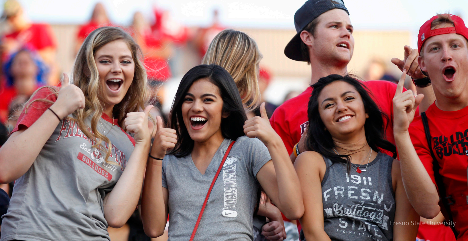
Fresno State University